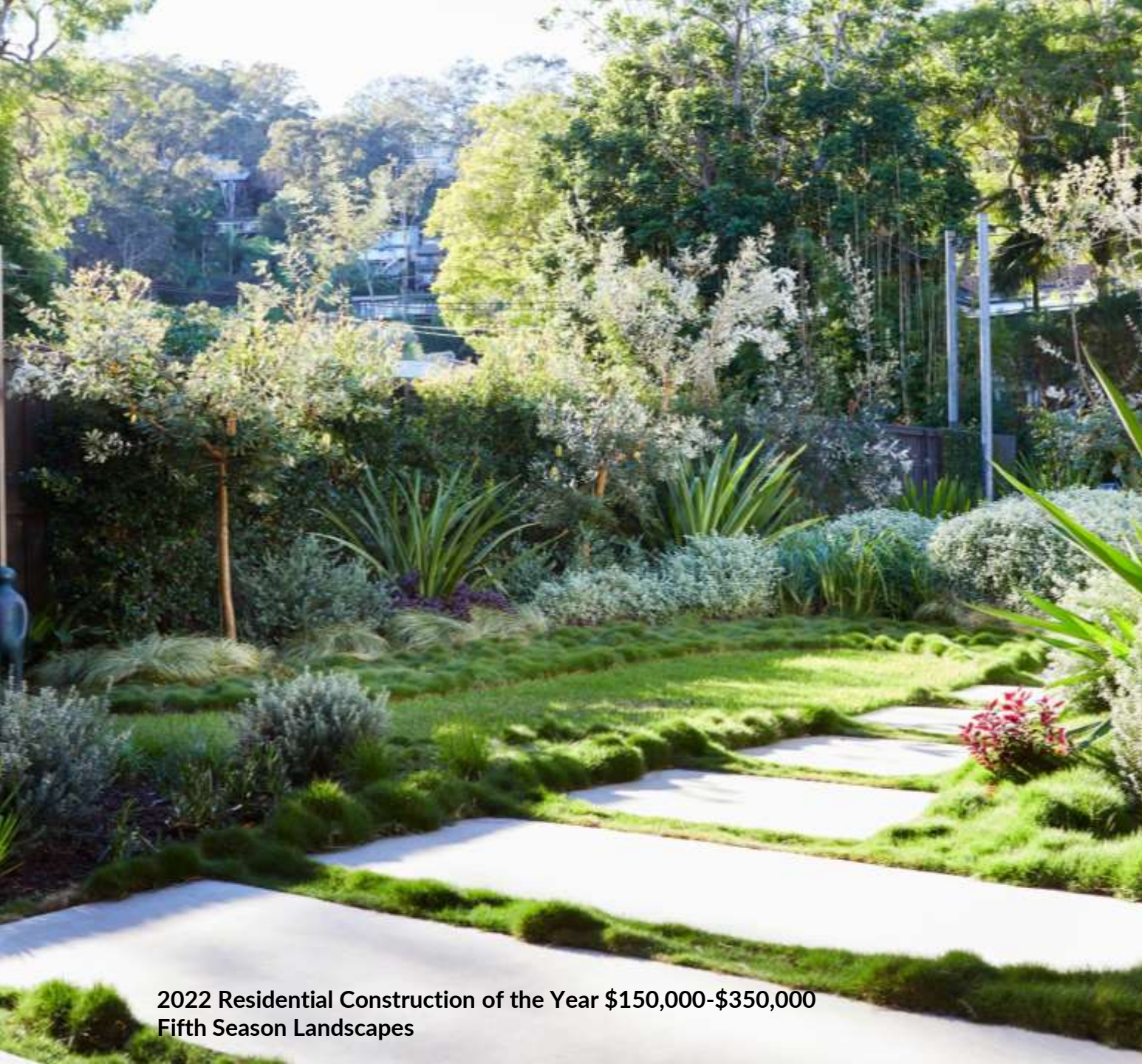
2022 Residential Construction of the Year $150,000-$350,000 Fifth Season Landscapes