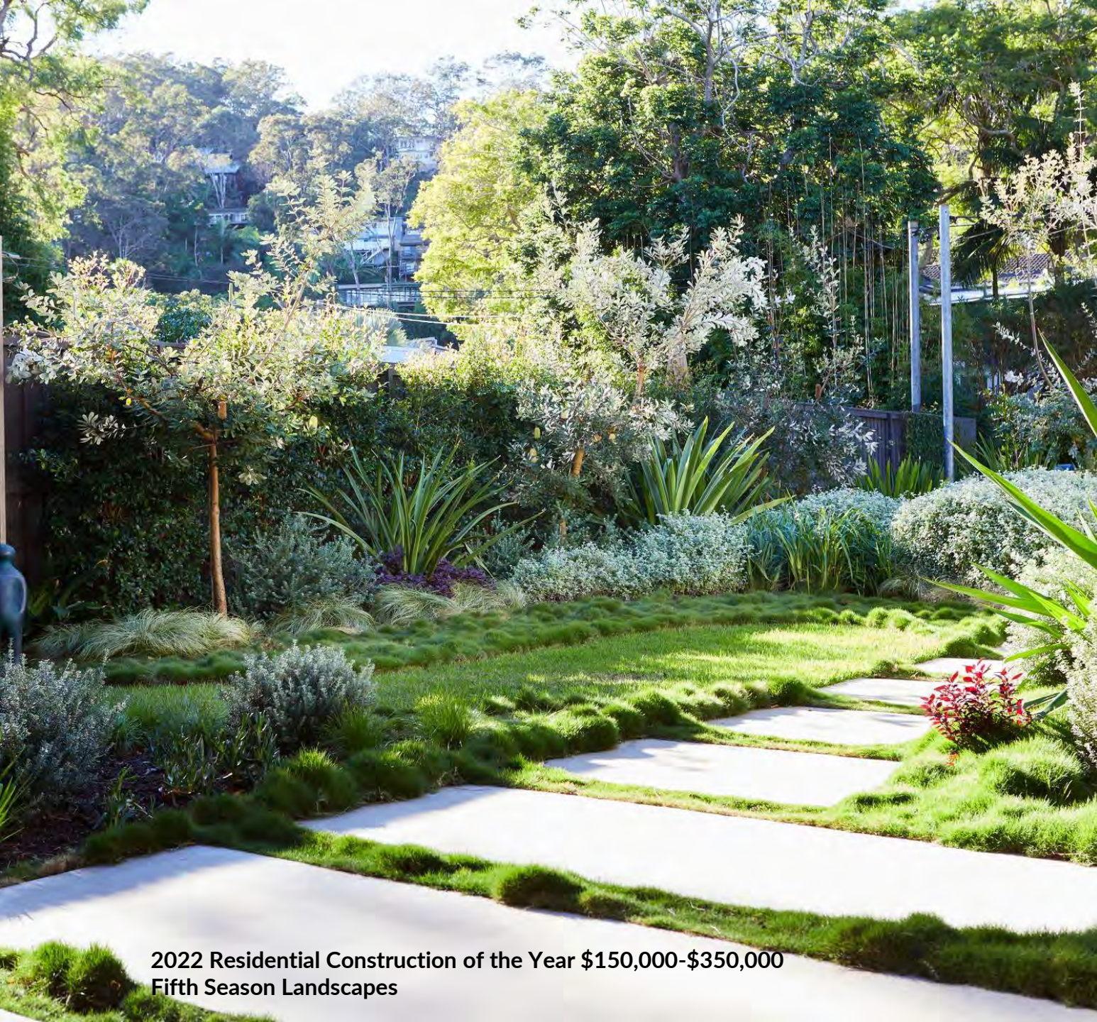
2022 Residential Construction of the Year $150,000-$350,000 Fifth Season Landscapes