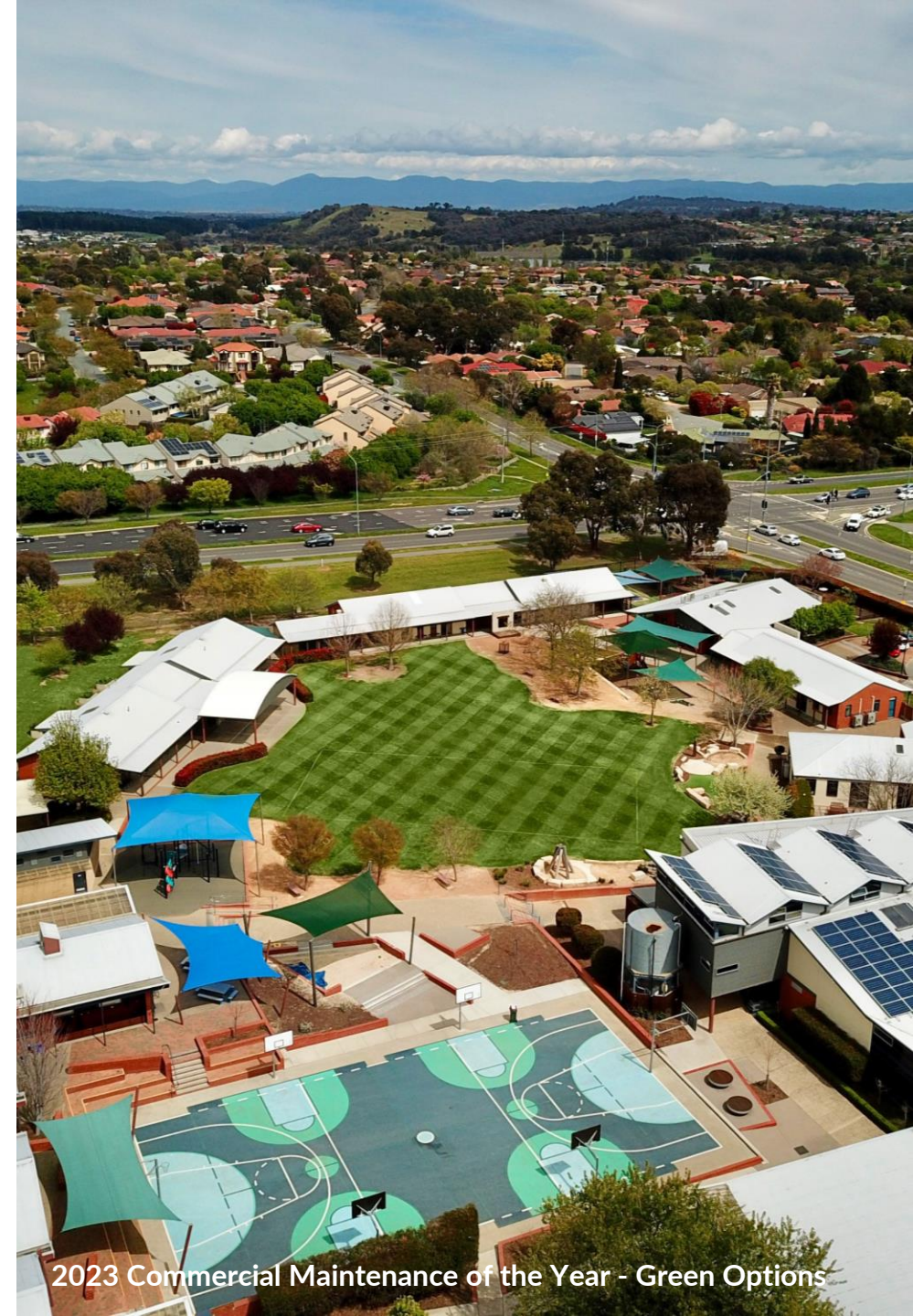
2023 Commercial Maintenance of the Year - Green Options